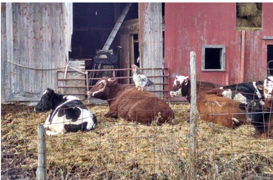
"Ruler of the Roost!"

Town Hall Offices will be closed Feb 16 th for Presidents Day and Court will not be in session.